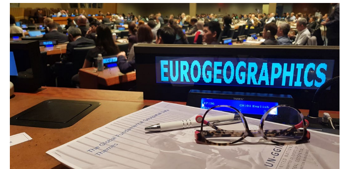
EuroGeographics is committed to ensuring your distinctive voice is heard within the United Nations