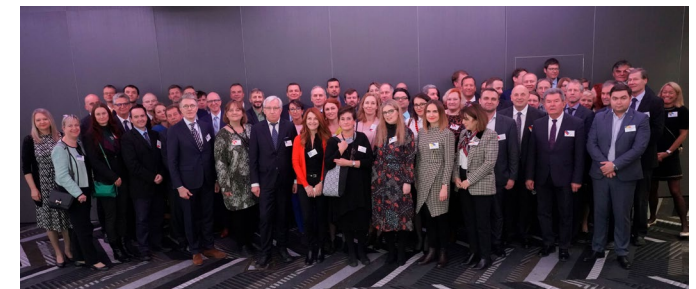
Our CLRKEN took an active role in the joint PCC workshop and plenary in Helsinki, Finland