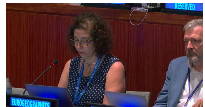
Your Association actively participates in UN-GGIM and UN-GGIM: Europe