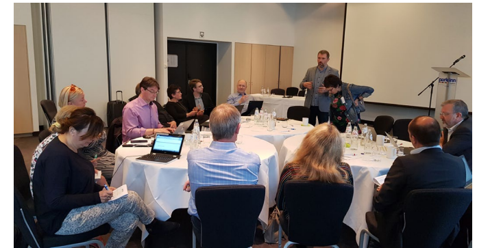
We held a 'Super' KEN workshop following the Extraordinary General Assembly