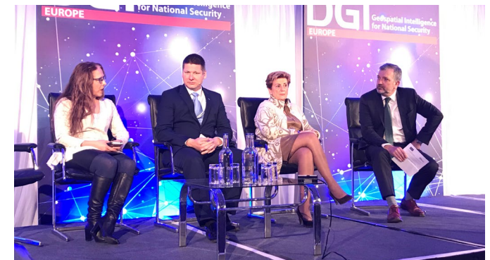
EuroGeographics members highlighted the role of NMCA data at DGI 2019

Our communications activities have continued to embrace opportunities to promote the importance of authoritative geospatial information to key stakeholders through events, social media and face-to-face meetings. We are also focussed on engaging keeping you up to date with the Association's response to issues impacting on your work through our members' newsletter and letters from our President.