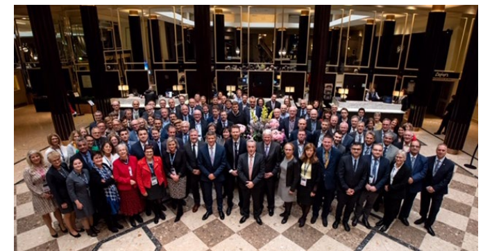
Members gathered in Manchester, UK for the 2019 General Assembly