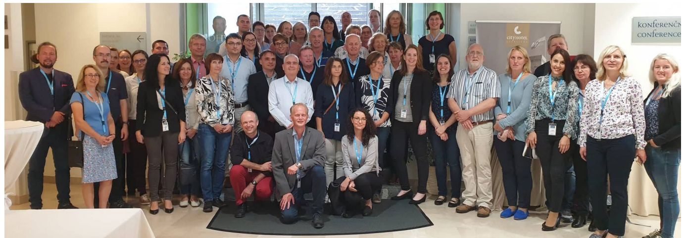
Our Data Producers - A unique example of international collaboration

Our production system is unique internationally, and a particularly important example of international collaboration in the geospatial area. Our production teams are multi-national distributed teams responsible for developing our innovative products and services. Their work is led from the Association's offices in Brussels and coordinated by production managers from Germany and France. Our 2019 annual data producers meeting was hosted by the Surveying and Mapping Authority of the Republic of Slovenia in Ljubljana.