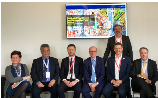
EuroGeographics Management Board took part in panel discussions at GWF