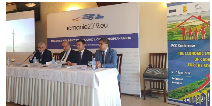
EuroGeographics was very pleased to participate in the PCC Plenary in Romania