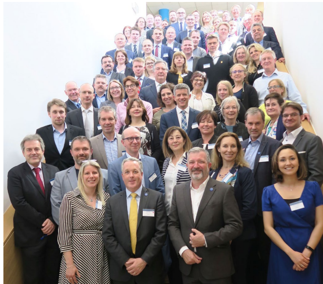
It was a pleasure to welcome so many members to our 2019 Extraordinary General Assembly

Seventy representatives from 33 member organisations participated in our extended 2019 Extraordinary General Assembly in Leuven, Belgium. To bring together KEN chairs and members, we again held a dedicated roundtable session. The meeting was followed by a 'Super' KEN workshop to discuss mutual topics of interest.