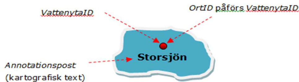
Attribut för Vattenyta